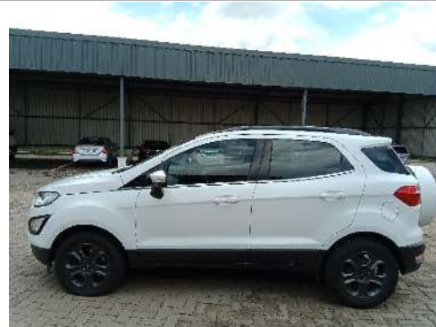
90 DEGREE LEFT

DEKRA Automotive (PTY) Ltd. 97 Willem Cruywagen Ave Klerksoord, Pretoria, 0200 Phone: 012 542 4867 www.dekraauto.co.za