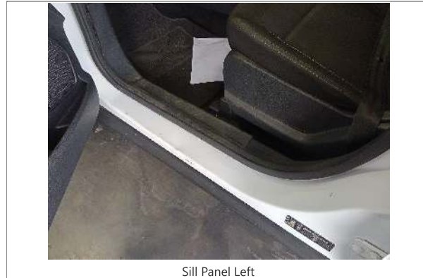
Sill Panel Left