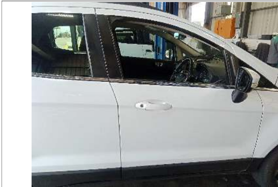
Door Front Right