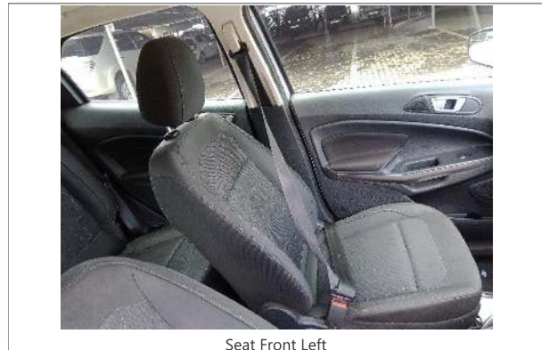
Seat Front Left

DEKRA Automotive (PTY) Ltd. 97 Willem Cruywagen Ave Klerksoord, Pretoria, 0200 Phone: 012 542 4867 www.dekraauto.co.za