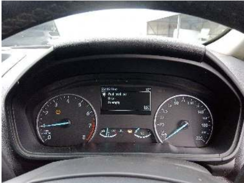
DASHBOARD (W/ ENGINE RUNNING)

DATE: 19/02/2024 VIN: WF01XXEP1901272891 4 / 12