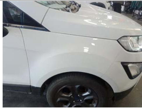
Front Fender Right