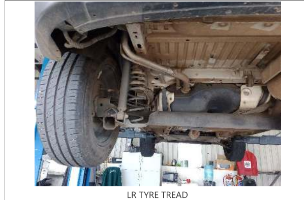
LR TYRE TREAD