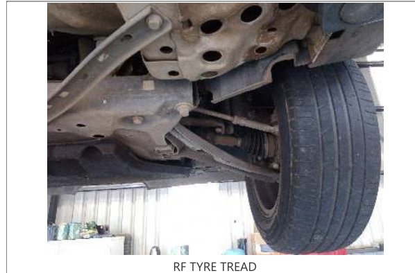
RF TYRE TREAD