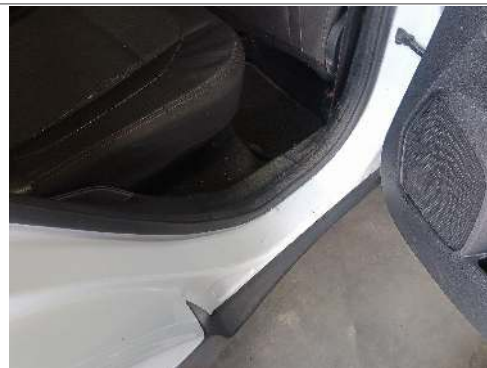
Sill Panel Right

DEKRA Automotive (PTY) Ltd. 97 Willem Cruywagen Ave Klerksoord, Pretoria, 0200 Phone: 012 542 4867 www.dekraauto.co.za