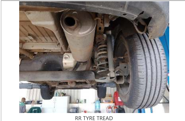
RR TYRE TREAD