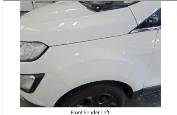
Front Fender Left