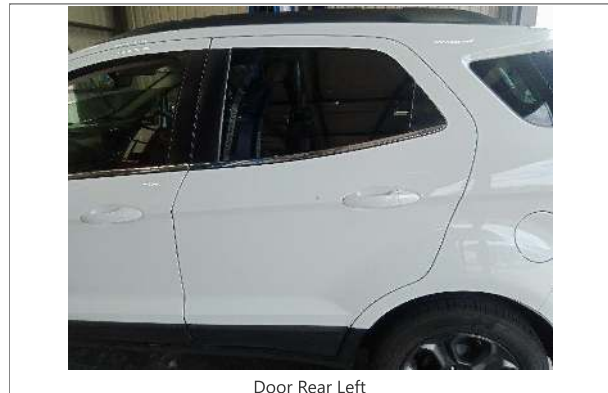
Door Rear Left

DEKRA Automotive (PTY) Ltd. 97 Willem Cruywagen Ave Klerksoord, Pretoria, 0200 Phone: 012 542 4867 www.dekraauto.co.za