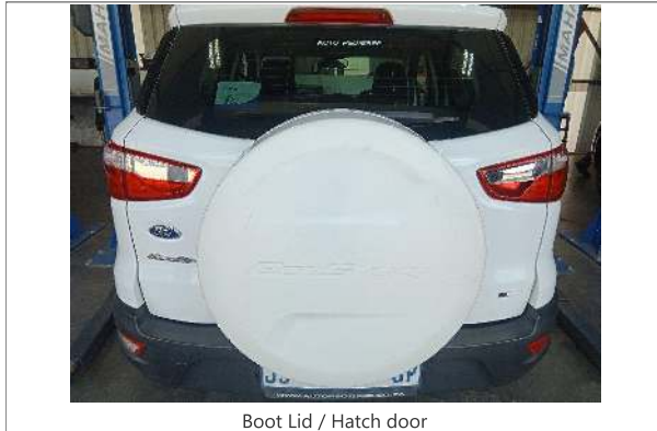
Boot Lid / Hatch door