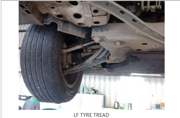
LF TYRE TREAD