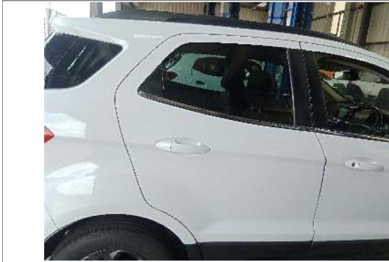
Door Rear Right