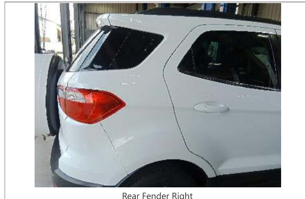
Rear Fender Right

DEKRA Automotive (PTY) Ltd. 97 Willem Cruywagen Ave Klerksoord, Pretoria, 0200 Phone: 012 542 4867 www.dekraauto.co.za