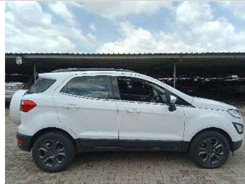
90 DEGREE RIGHT