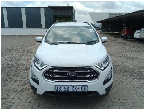
90 DEGREE FRONT