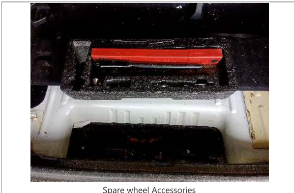
Spare wheel Accessories