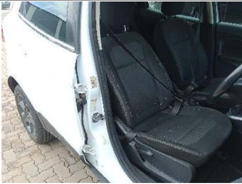
Seat Front Right