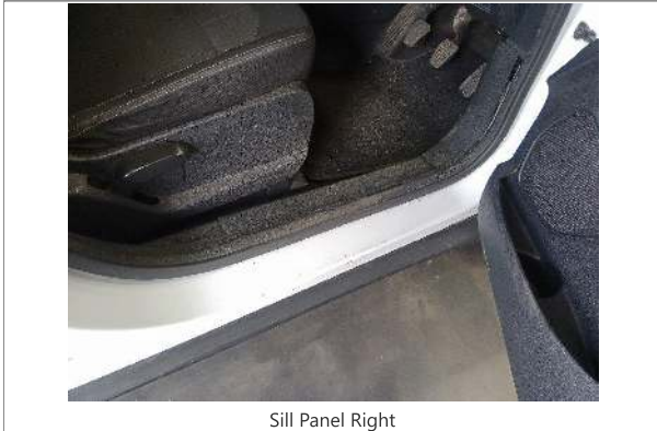
Sill Panel Right