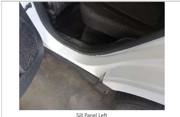
Sill Panel Left