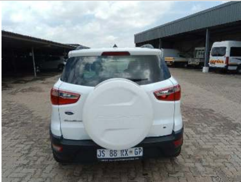
90 DEGREE REAR