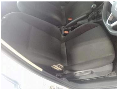
Seat Front Right

DEKRA Automotive (PTY) Ltd. 97 Willem Cruywagen Ave Klerksoord, Pretoria, 0200 Phone: 012 542 4867 www.dekraauto.co.za