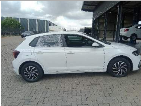
90 DEGREE RIGHT