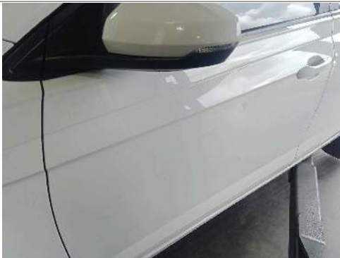
Door Front Left