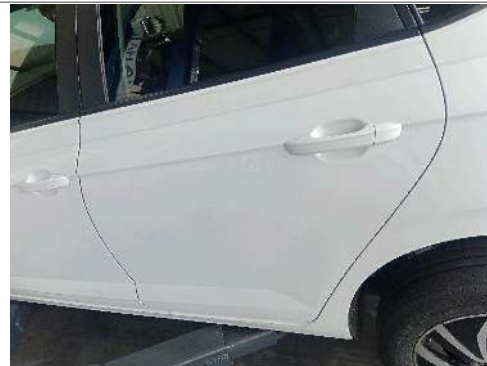
Door Rear Left

DEKRA Automotive (PTY) Ltd. 97 Willem Cruywagen Ave Klerksoord, Pretoria, 0200 Phone: 012 542 4867 www.dekraauto.co.za