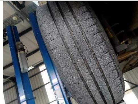
Tyre Rear Left