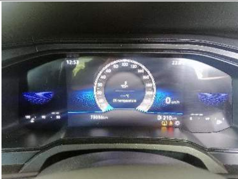
DASHBOARD (W/ ENGINE RUNNING)