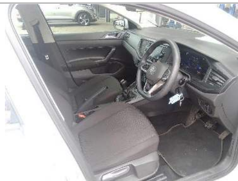
INTERIOR (FRONT DRIVER DOOR)

DEKRA Automotive (PTY) Ltd. 97 Willem Cruywagen Ave Klerksoord, Pretoria, 0200 Phone: 012 542 4867 www.dekraauto.co.za