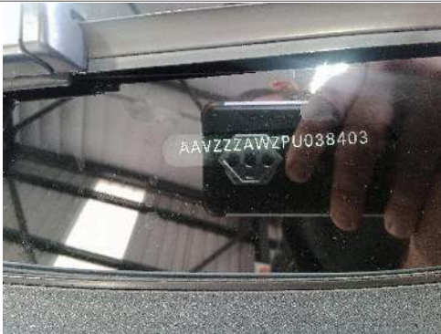
VIN PLATE OR STICKER