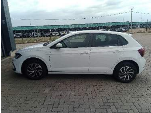
90 DEGREE LEFT