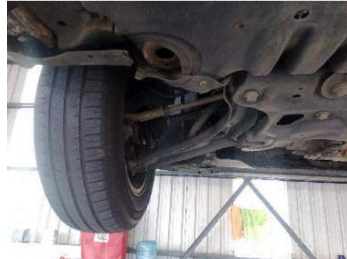
LF TYRE TREAD