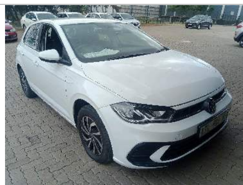
FRONT RIGHT CORNER