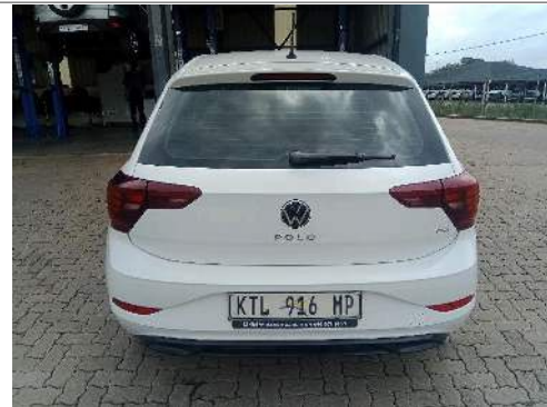
90 DEGREE REAR

DEKRA Automotive (PTY) Ltd. 97 Willem Cruywagen Ave Klerksord, Pretoria, 0200 Phone: 012 542 4867 www.dekraauto.co.za