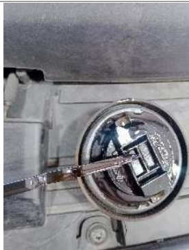
Oil cap and dipstick.