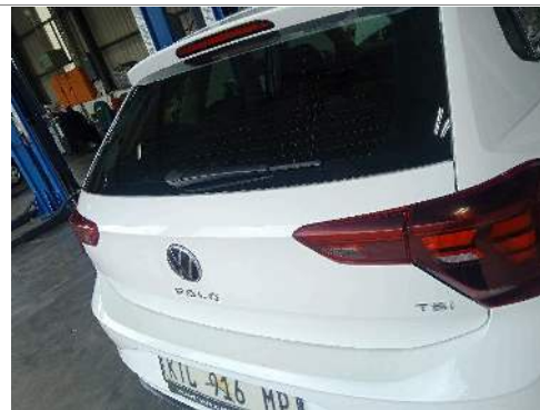
Boot Lid / Hatch door