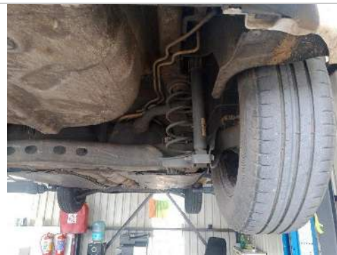
RR TYRE TREAD