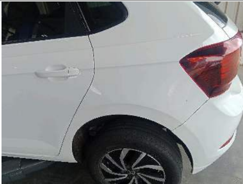
Rear Fender Left