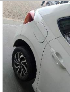
Rear Fender Right