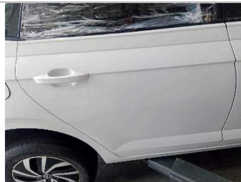
Door Rear Right

DEKRA Automotive (PTY) Ltd. 97 Willem Cruywagen Ave Klerksoord, Pretoria, 0200 Phone: 012 542 4867 www.dekraauto.co.za