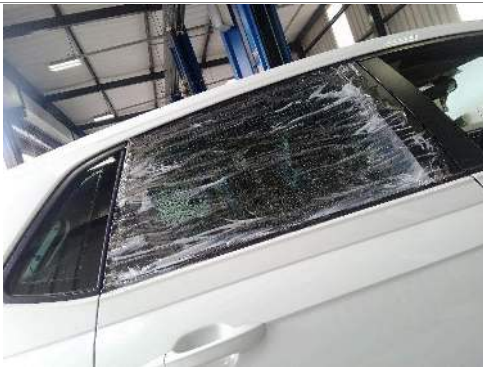
Window Rear Door Right