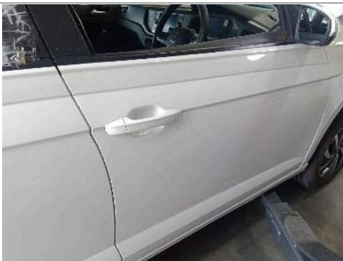
Door Front Right