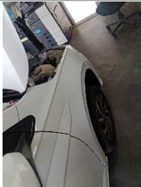
Front Fender Right