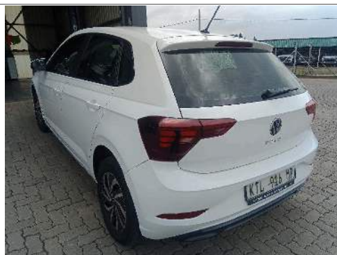
REAR LEFT CORNER