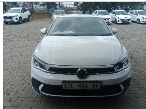
90 DEGREE FRONT