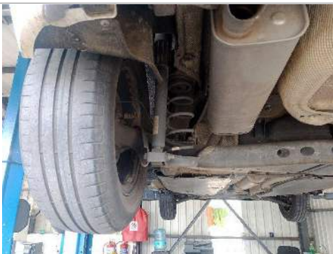
LR TYRE TREAD