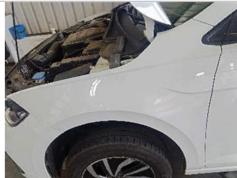
Front Fender Left