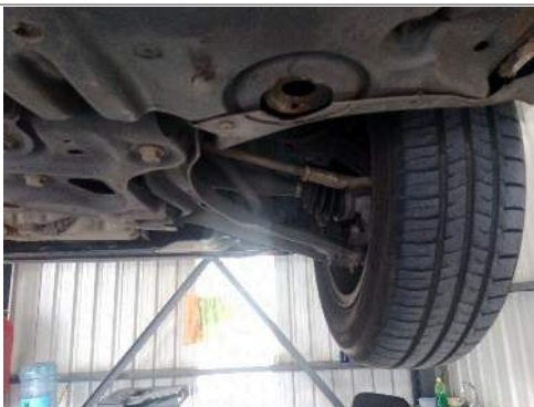
RF TYRE TREAD